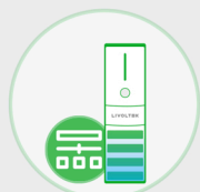
Elegant Modular and Unified Design