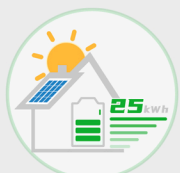
Flexible Storage Capacity up to 25 kWh