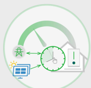
Export Control and Time-of-use Shifting